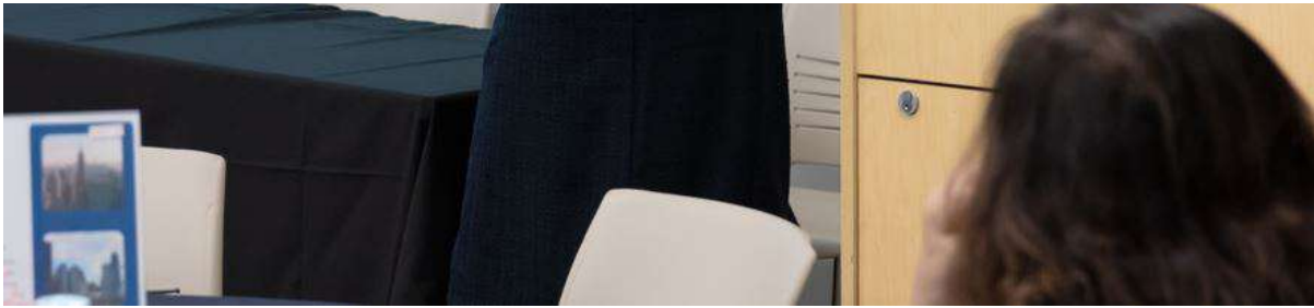
Deputy Mayor of Immigrant, Migrant, and Refugee Rights Beatriz Ponce De León speaking at 2024 DMC Symposium.

WHO WE ARE: The DePaul Migration Collaborative engages scholars, practitioners, students and alumni to find solutions to society's most pressing problems in the areas of migration, mobility and human rights.