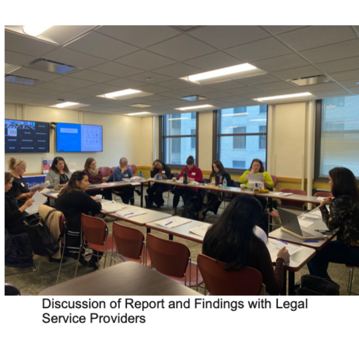
Discussion of Report and Findings with Legal Service Providers