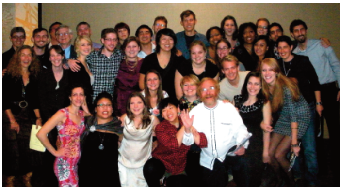
Chicago attendees at the 2011 NLG convention.

The NLG Convention was an experience that will not soon be forgotten, and its impact will reverberate as each student and practitioner continues his or her personal fight for justice.