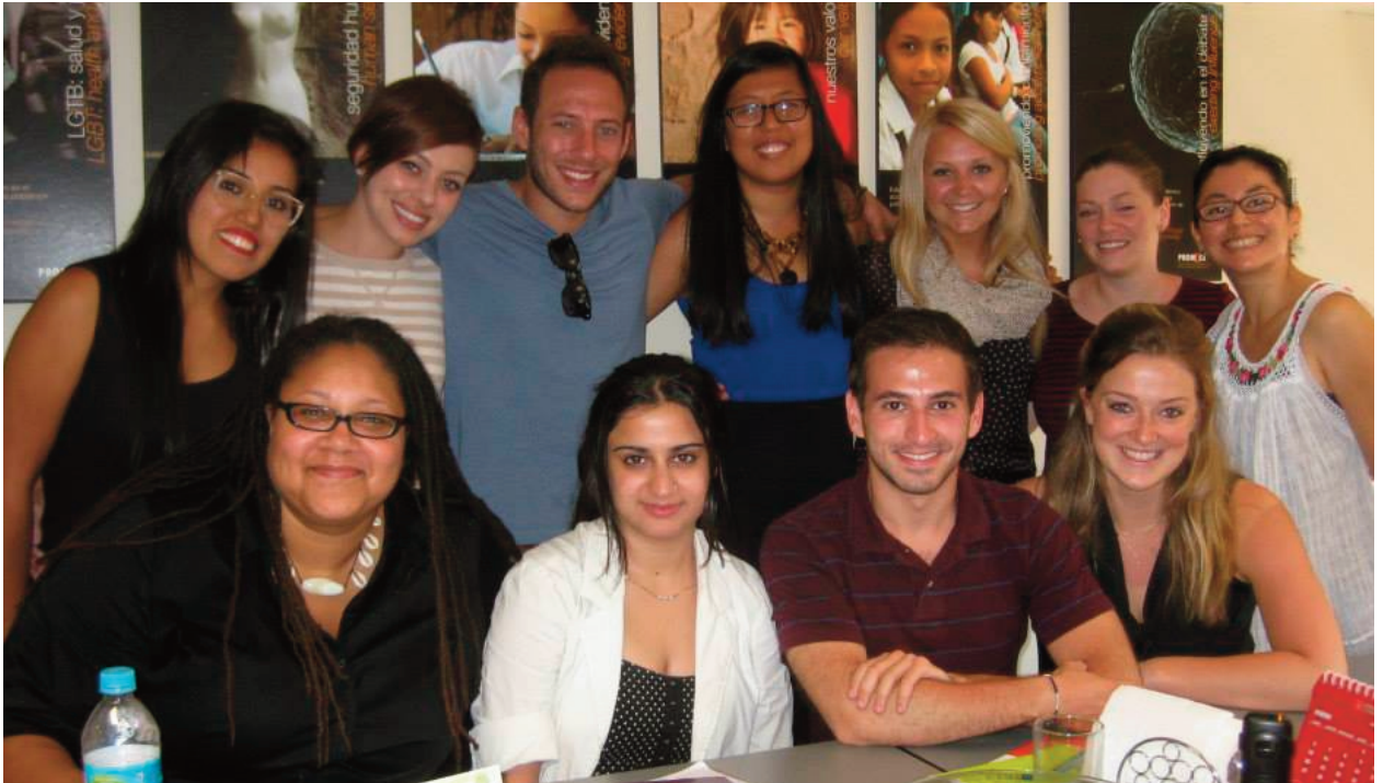
Peru practicum participants

In late January, the International Human Rights Law Practicum students spent a week in Lima, Peru.