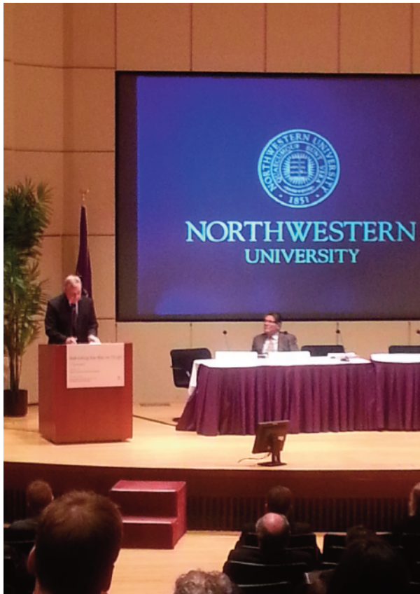
Panelists debate drug policy at Northwestern symposium.